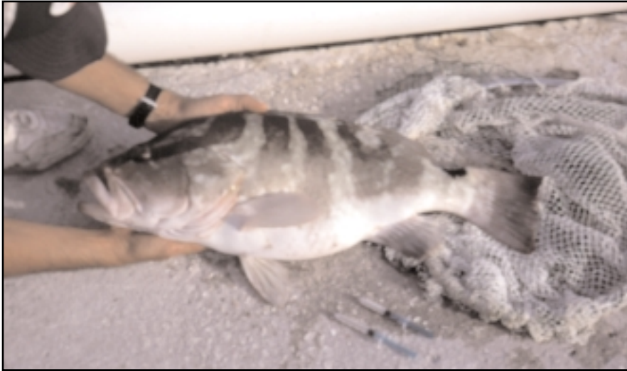
Figure 2. A female Nassau grouper that has been induced to ovulate and is about to be stripped.

injections of 4.5 to 22.7 \mu\text{g} gonadotropin-releasing hormone analog (GnRHa) per pound of body weight (10 to 50 \mu\text{g}/\text{kg} ). GnRHa implants also have worked. If newly caught broodfish are used, the hormone should be administered as soon after capture as possible to limit the effects of stress on oocyte development. For six grouper species with egg diameters of 800 to 1,000 \mu\text{m} , the minimum effective oocyte diameter (seen in biopsy samples) before injection was in the range 41 to 61 percent of the fertilized egg diameter; ovarian biopsies are not necessary if external characteristics can be relied upon as indicators of oocyte development. Females are handled as little as possible, but are monitored closely for swollen abdomen, protruding genital papilla, stretching of the membrane holding eggs in, and spawning coloration. They are checked more often (e.g., once an hour) just before the predicted time of ovulation. For Nassau groupers, the time from ovulation to overripeness (deterioration of eggs) is only 1 to 2 hours at 79 degrees F (26 degrees C).